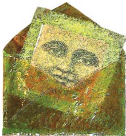
Envelope by Kathy Wegner

IMPORTANT INFORMATION: Too much heat/dwell time/pressure will cause film to become more coppery, or a loss of color may occur and film may bubble or melt away. Colors change with heat. Fantasy Film and Fiber fuses to itself and to each other only. Use with Art Glitter and/or Fantasy Fiber for endless possibilities!